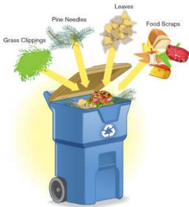
Yard Debris Cart Tan Highlighted Week (subscription service)

Please position roll cart with the handles toward the house and lids opening toward the street.